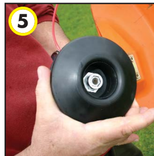
5 Wind head onto gearbox until hand-tight. Remember it could be a left hand thread!