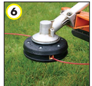
6 Job Done! Ready to go.

Colletts, nuts and bolts are included to adapt to most strimmers.