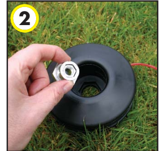
2 Place nut or bolt inside collett, and push into recess of head.