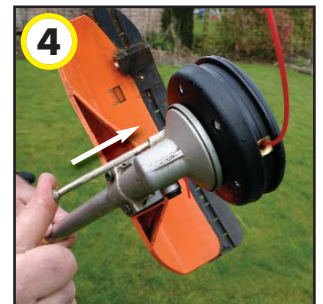
4 Lock gearbox to prevent rotation with suitable pin or screwdriver.