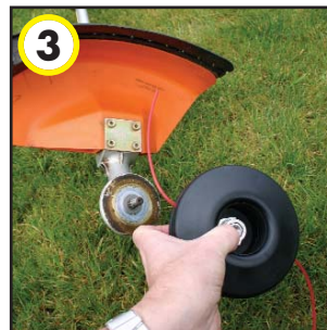
3 Locate unit onto the gearbox making sure it is centred and the right collett is selected.