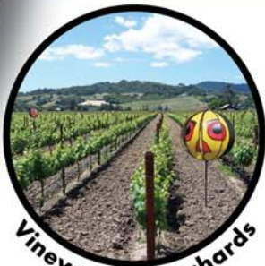
Vineyards & Orchards

Several strategically placed Hawk Eyes are needed using a mix of red and yellow globes to be effective