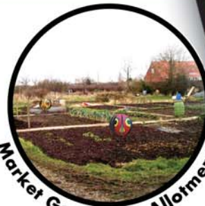
Market Gardens & Allotments